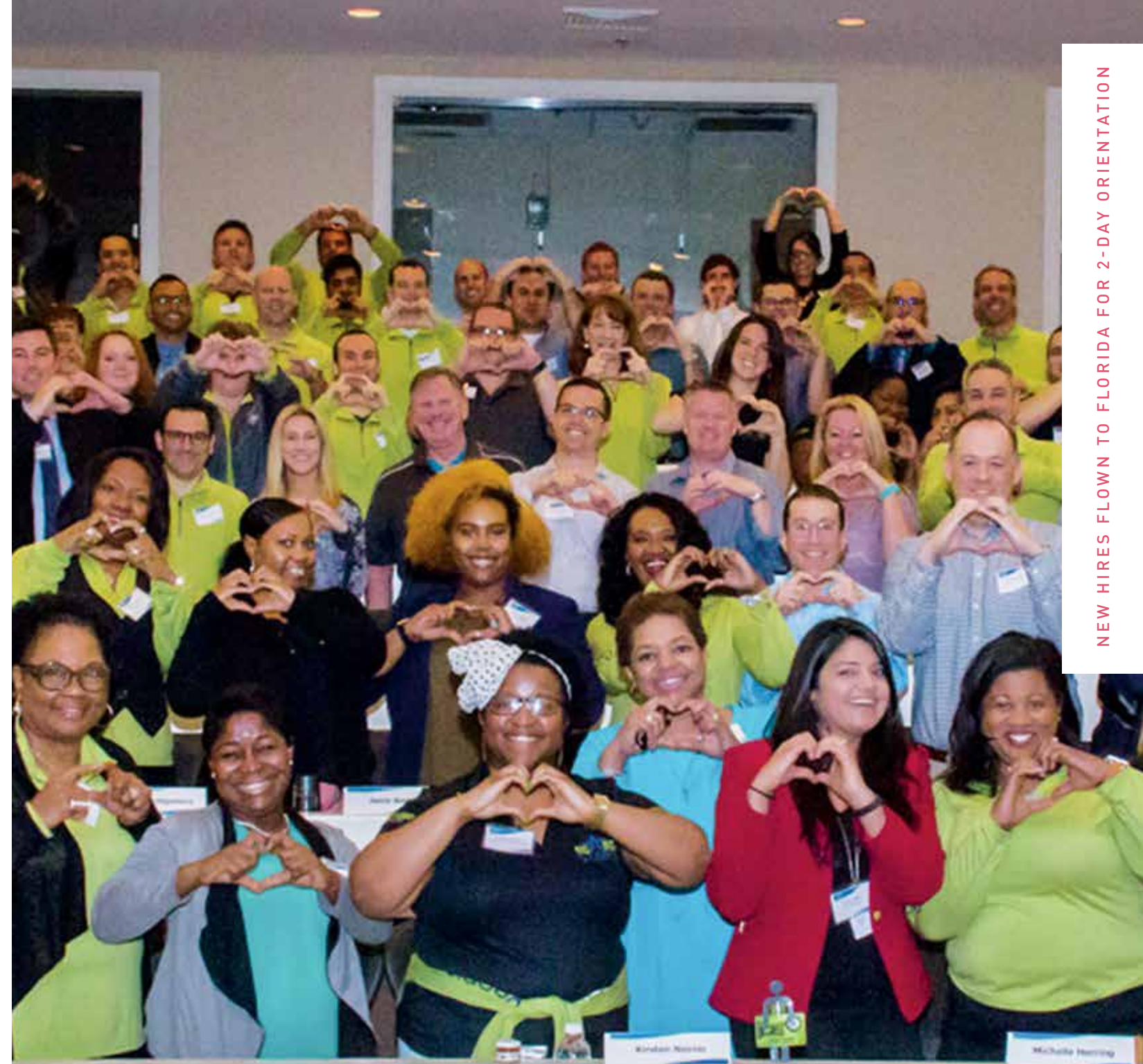
NEW HIRES FLOWN TO FLORIDA FOR 2-DAY ORIENTATION