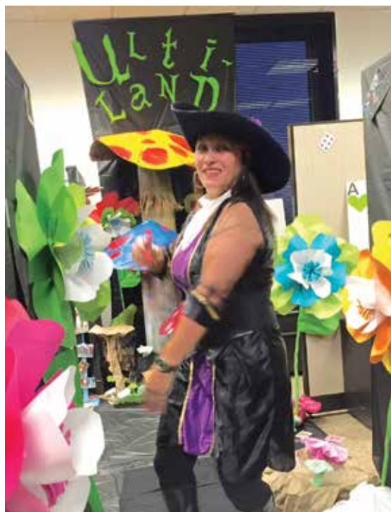
CUBE DECORATING TAKEN TO THE MAX