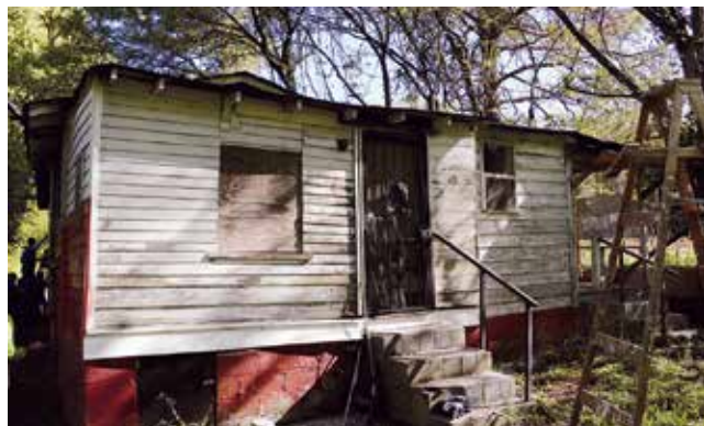
BEFORE PICTURE OF GEORGIA HOME ABOVE

UltiPeeps have rebuilt 12 homes in the last two years by partnering with Rebuilding Together in four cities — Ft. Lauderdale, Atlanta, Alpharetta, and Santa Ana.