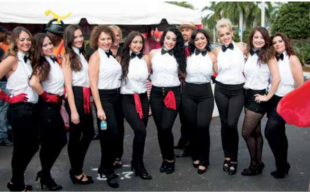
POSING BEFORE STRUTTING THEIR STUFF

On Halloween, teams have fun going all out to come up with the most original costumes, and many augment their costumes with skits designed to provoke laughter. There are prizes for the best, and it's a big honor to win.