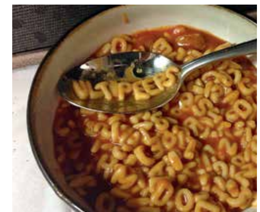
SPELLING IMPORTANT WORDS LIKE "ULTIPEEPS" IN SOUP