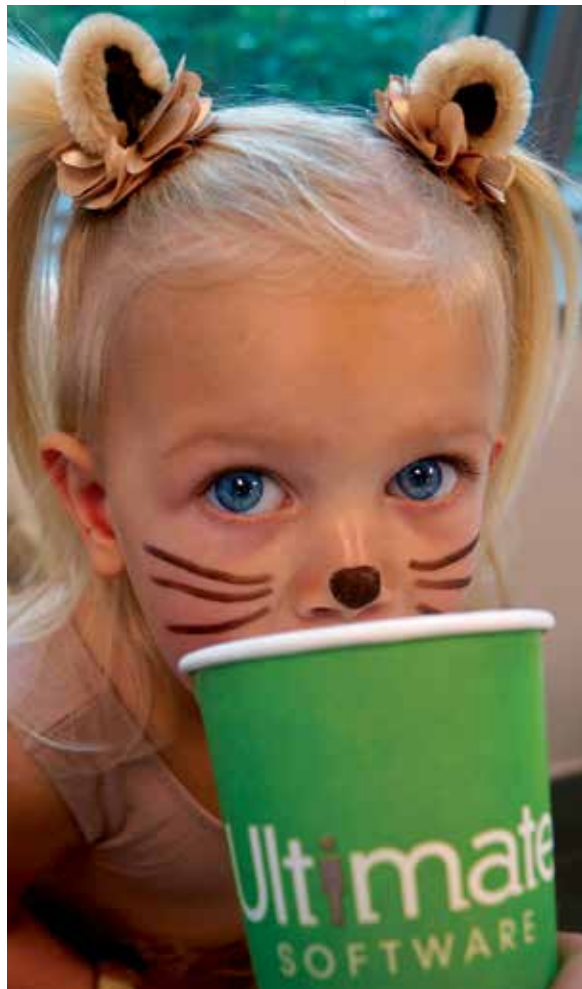
I'D RATHER DRINK JUICE THAN WALK IN A PARADE

Ultimate Software's leaders recognize and support the importance of children in our people's lives. Ultimate has included children in Halloween festivities, Bring Your Child to Work Day, and the teams' reward trips over the years.