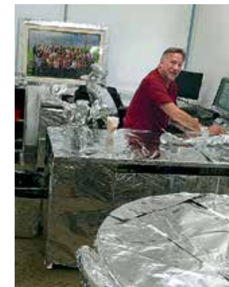
PRANKING A LEADER BY COVERING HIS OFFICE IN FOIL