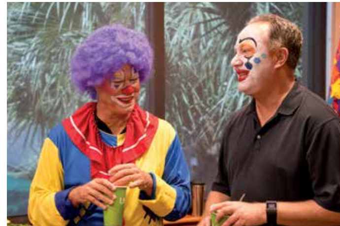
COO AND CEO DISCUSSING BUSINESS BEFORE THE PARADE