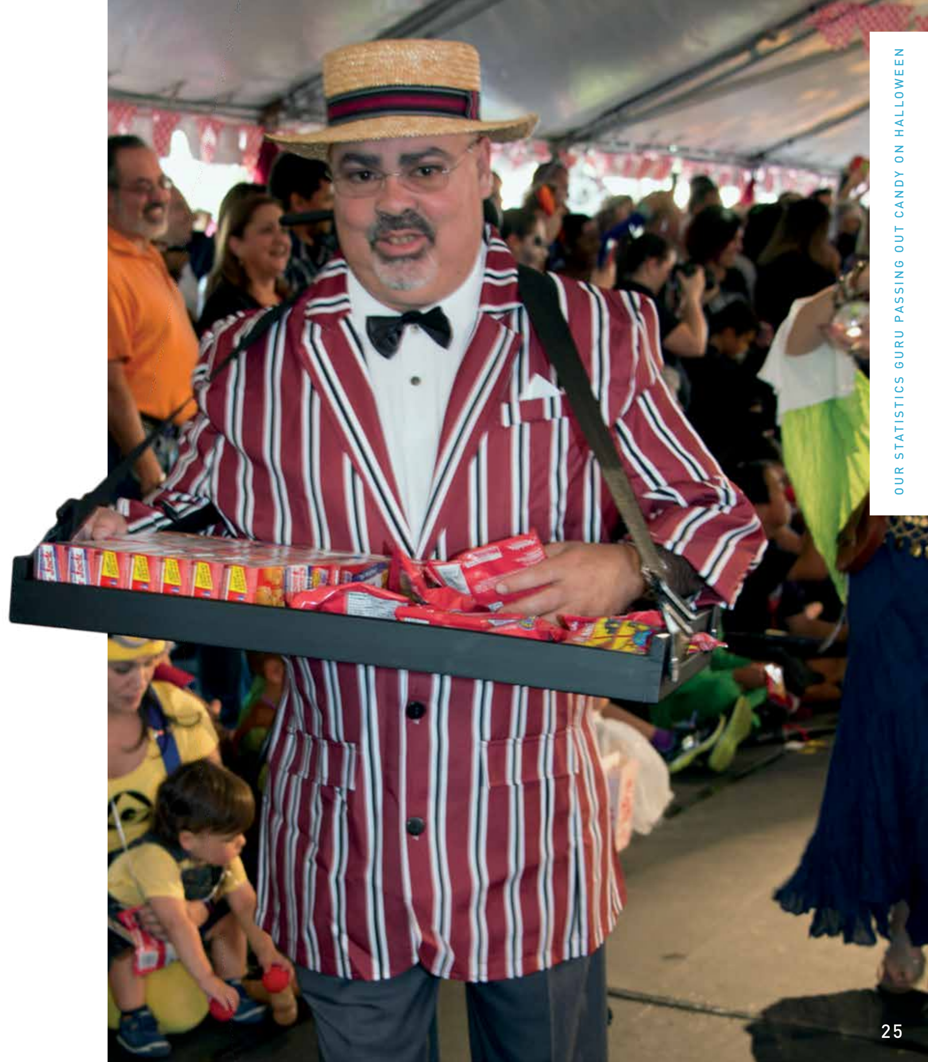
OUR STATISTICS GURU PASSING OUT CANDY ON HALLOWEEN