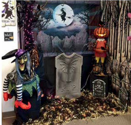
OUR ALPHARETTA OFFICE GOING THE SPOOKY ROUTE

Every year, Halloween is a day of camaraderie and fun at Ultimate Software. We have workspace-decorating contests, team and individual costume competitions, pumpkin-carving contests, gooey treats to eat, and a costume parade that includes our UltiPeeps' children.