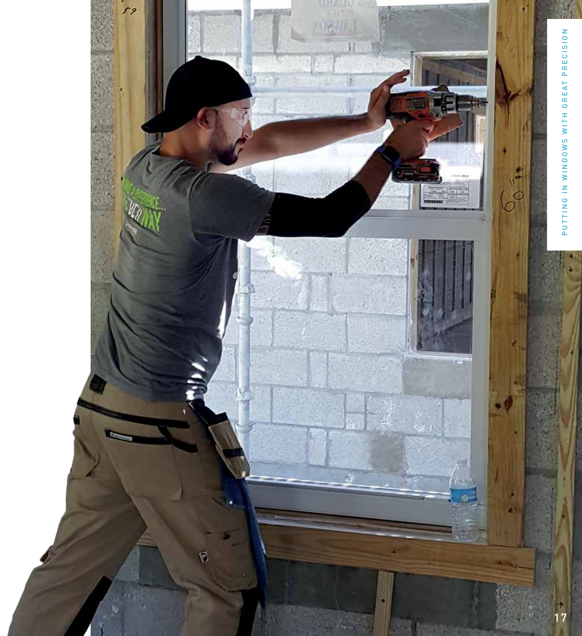
PUTTING IN WINDOWS WITH GREAT PRECISION