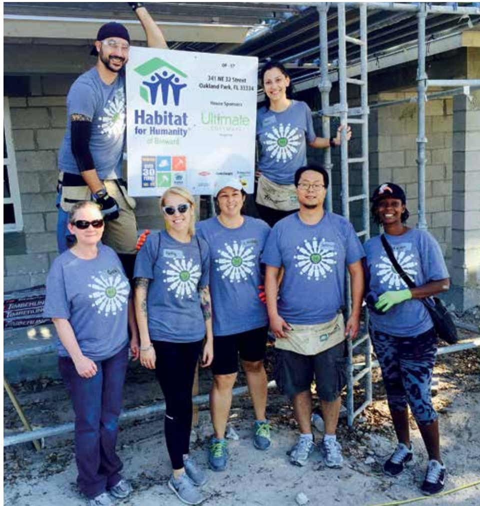
SMALLER TEAM THAT TOOK A DAY TO DONATE TIME TO THE ULTIHOME

Ultimate Software employees have been partnering with Habitat for Humanity for 8 years. 2016 is the first year that Ultimate has financially sponsored the building of an entire home from start to finish, with UltiPeeps performing the labor under Habitat for Humanity's direction. The house is the new permanent home for a family of five, who have been living in an apartment where the three children shared one bed and the parents slept on the sofas.