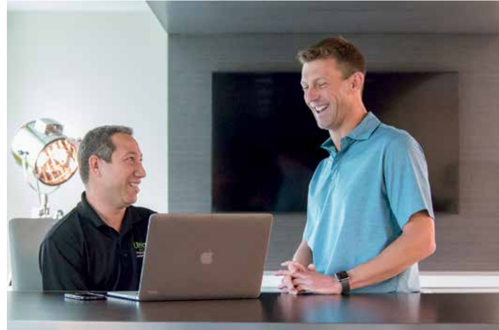
CTO ADAM APPRECIATING SPUR-OF-THE-MOMENT CHATTER WITH FELLOW ULTIPEEP