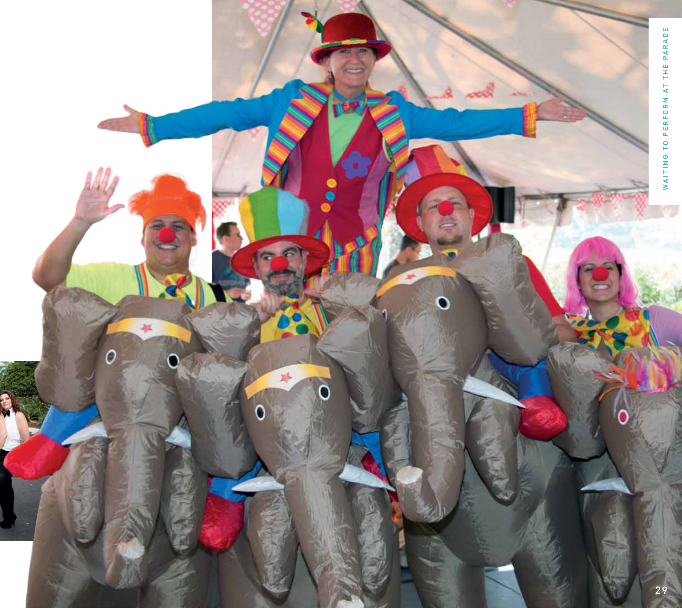
WAITING TO PERFORM AT THE PARADE