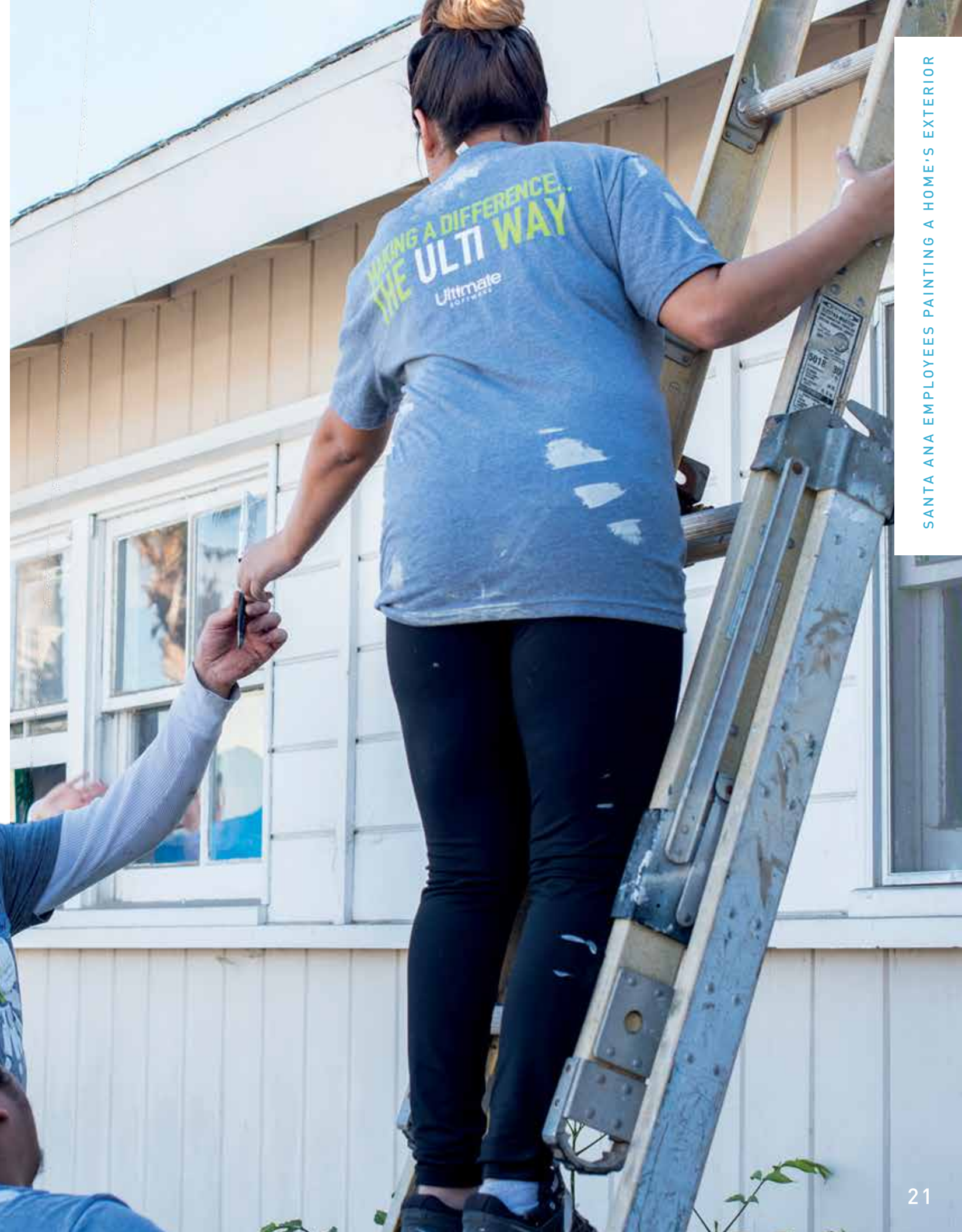
SANTA ANA EMPLOYEES PAINTING A HOME'S EXTERIOR