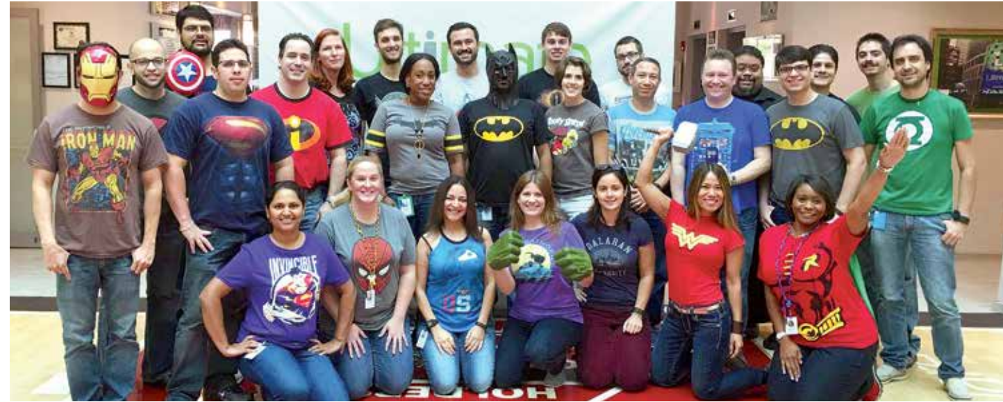
SUPERHERO T-SHIRT DAY

UltiPeeps look for small ways to have fun on a routine basis. We know our leaders respect the value of humor to lighten the load of a hard day's work, and it creates a sense of camaraderie.