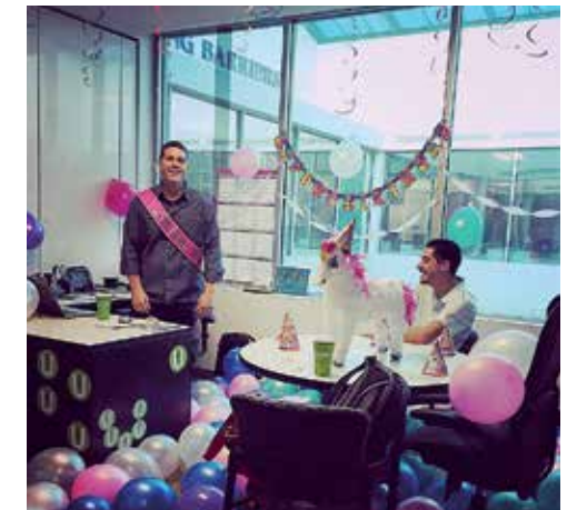
GOTTA CELEBRATE BIRTHDAYS