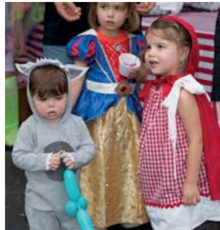
THINKING ABOUT WALKING IN THE PARADE