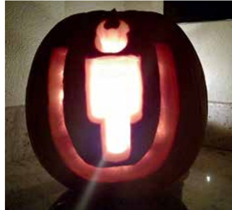
ULTILOGO PUMPKIN, ONE OF MANY IN THE CARVING CONTEST