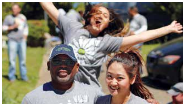
HAPPY TO BE DONATING TIME TO HELPING PEOPLE