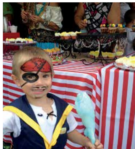
SO MANY GOOD THINGS TO EAT