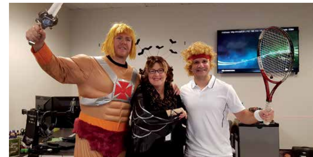
ATLANTA DIRECTORS HEADING TO THEIR HALLOWEEN PARADE

Our executives dress up, pass out candy to children attending, and judge the costume contests. They are always approachable, casual, and warm with UltiPeeps, but on Halloween they go one step further.