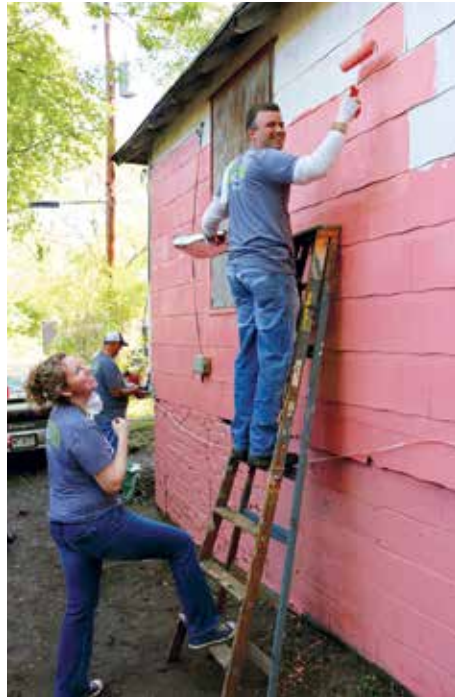
ALPHARETTA EMPLOYEES PAINTING A HOUSE'S EXTERIOR

UltiPeeps have rebuilt 12 homes in the last two years by partnering with Rebuilding Together in four cities — Ft. Lauderdale, Atlanta, Alpharetta, and Santa Ana.