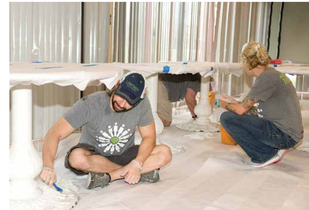
PREPPING TABLES FOR PAINT