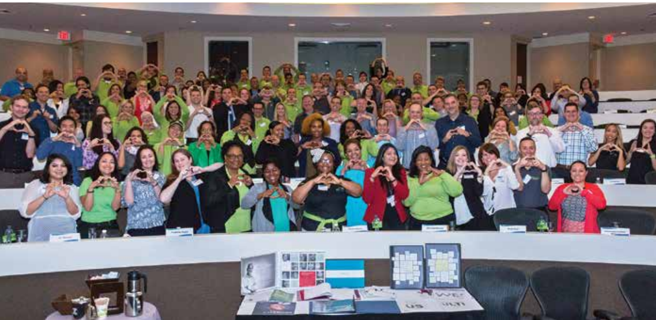
NEW HIRES MAKING HEART SIGNS AT HEADQUARTERS ORIENTATION MEETING