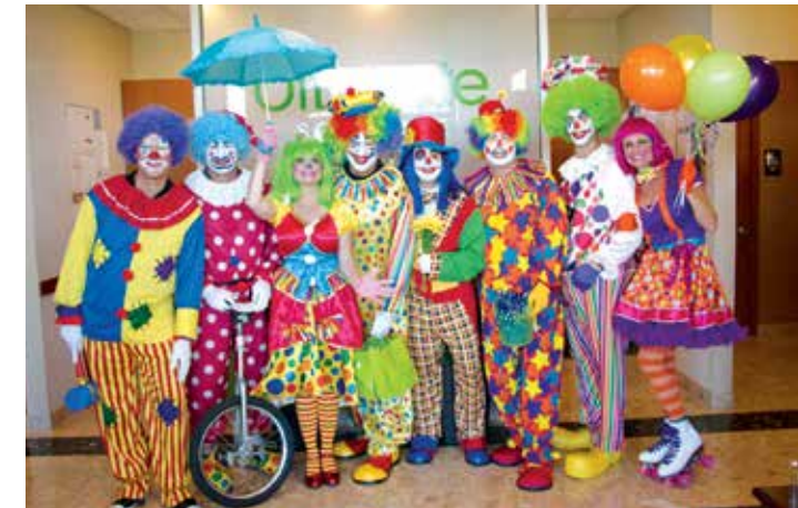
WESTON EXECUTIVE TEAM READY FOR PARADE

Our executives dress up, pass out candy to children attending, and judge the costume contests. They are always approachable, casual, and warm with UltiPeeps, but on Halloween they go one step further.