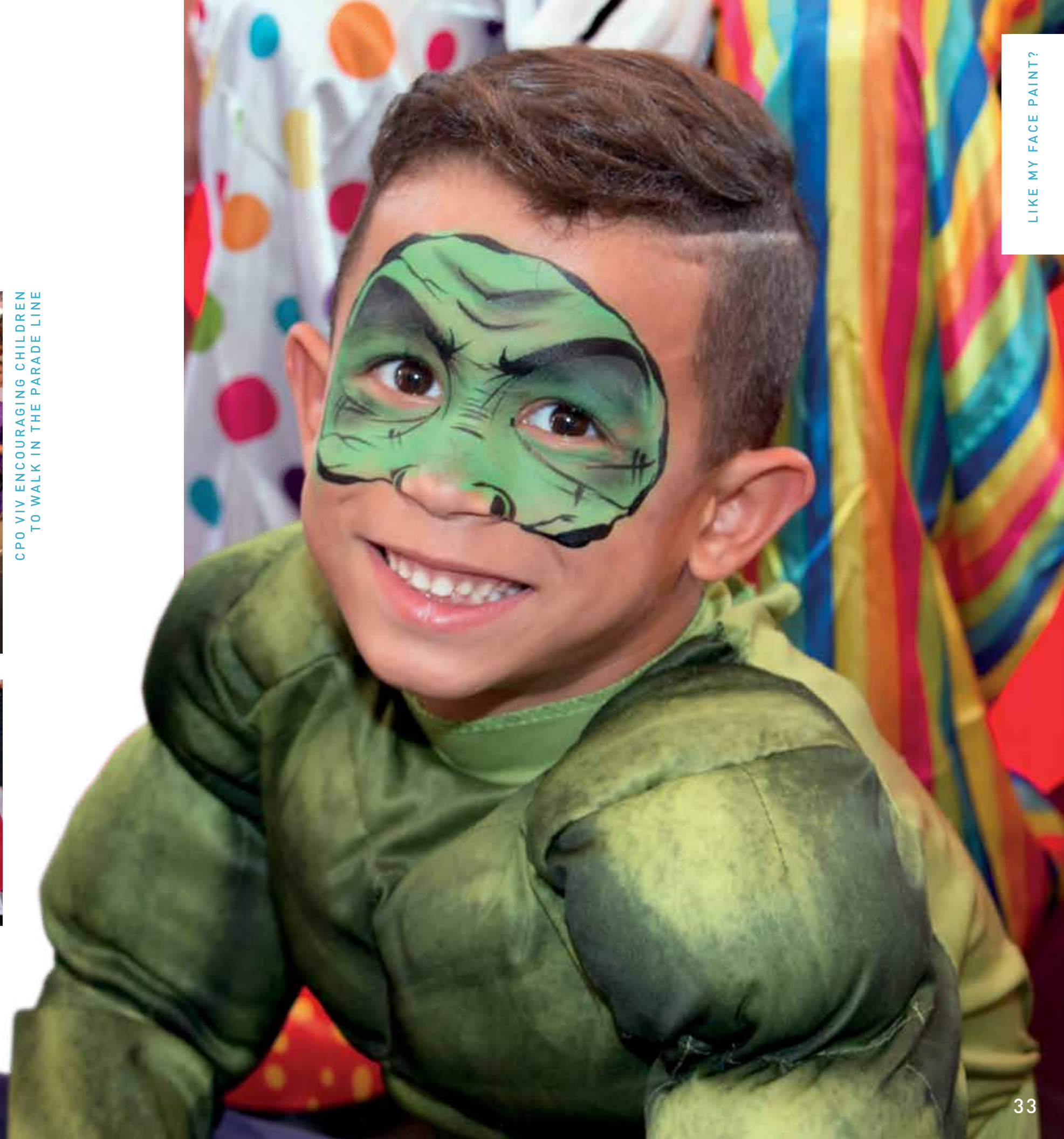
LIKE MY FACE PAINT?