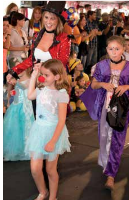
CPO VIV ENCOURAGING CHILDREN TO WALK IN THE PARADE LINE